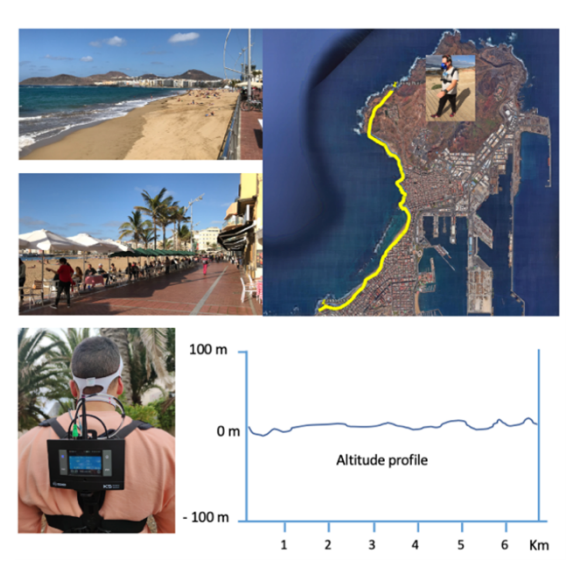
Figure 1. Some pictures of La Playa de Las Canteras walking route and the COSMED K5 device attached on the back of one of the volunteers

Accurate assessment of walking energy expenditure in the main seafront walking route of Las Palmas de Gran Canaria to promote health-related tourism Galván-Álvarez et al.