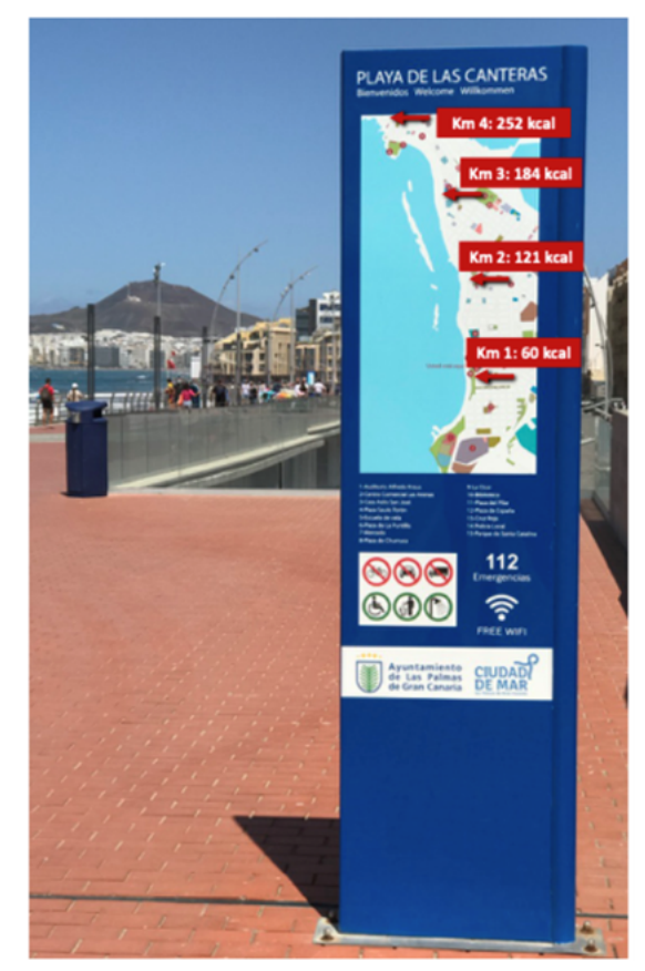
Figure 3. Representation of a Walker's Point of Interest with the information of the energy expenditure accumulated after the 1st, 2nd, 3rd and 4th km.